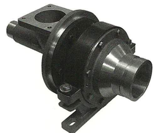
Standard Victaulic Version I-hub for 5300 Series