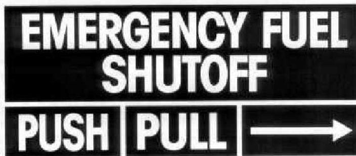
EMERGENCY FUEL SHUTOFF DECAL - GTP-834-32 - 8-1/2" x 20" - white on red

The LABEL DECAL , as you can see, has over 50 labels which can be cut with a pair of scissors and used as necessary. The advantage is fourfold.