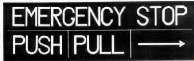
EMERGENCY STOP DECAL - GTP-834-29 - 6" x 20" - white letters on red background

EMERGENCY STOP and EMERGENCY FUEL SHUTOFF decals are intended to be used in accordance with the NFPA 407 specification for fixed and vehical emergency stop controls. The specification calls out 2" high letters and the words PUSH, PULL or an arrow to indicate operation of the emergency stop switch. As you can see, we have included these instructions on two separate decals. Choose the style you prefer.